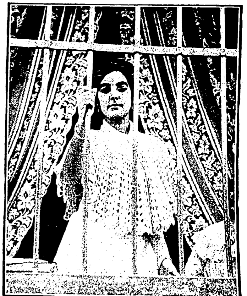
A PANAMA STREET SCENE The beauty behind the bars is not looking wistfully out from a dungeon. This iron fence, or grill, is to be found in the windows of private residences of the better class in Panama, and takes the place of the chaperon.