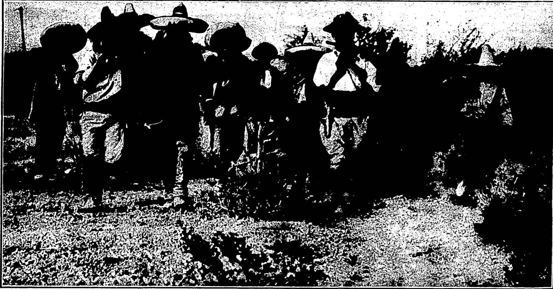
SCENE FROM THE WAR ZONE IN MEXICO This picture shows soldiers returning from a slaughter of Federals.