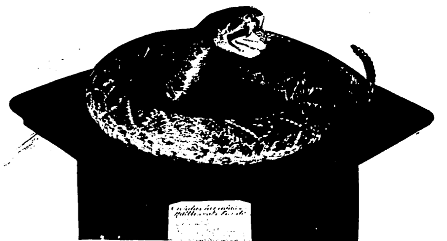
THE AMERICAN RATTLESNAKE This reptile derives its name from an appendage of eight or nine loosely connected horny rings, which it bears at the end of its tail, the shaking of which makes a noise like a rattle. This is one of the most deadly snakes known, and it is found all over the United States in mountainous places. It also enters Canada.