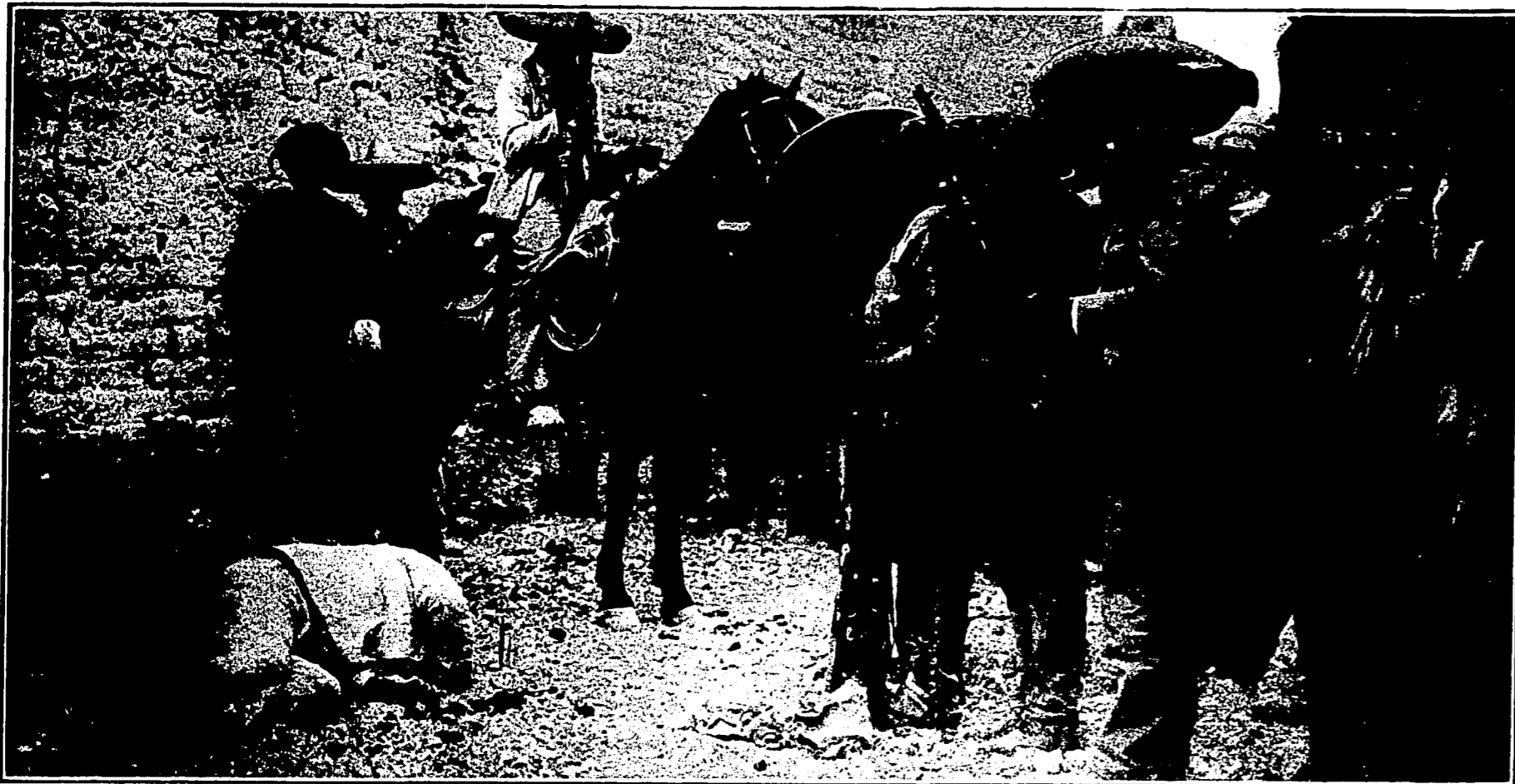
SCENE FROM THE WAR ZONE IN MEXICO This picture shows the execution of a Federal officer, who, after the capture of Jaurez by the rebel General Villa, was caught while trying to escape in the uniform of a common soldier.