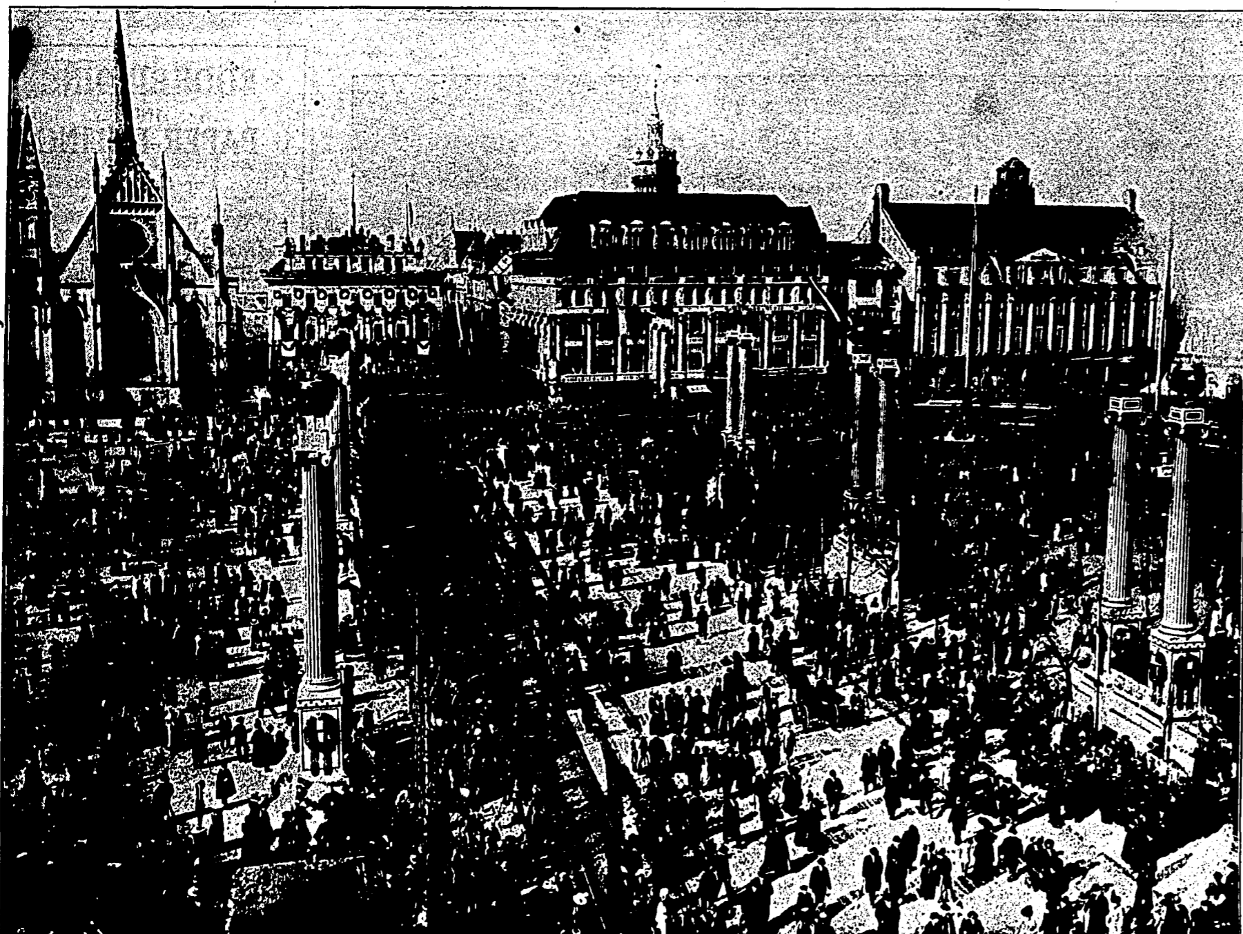
A SQUARE IN ONE OF THE IMPORTANT CITIES OF GERMANY. "BATTLE OF THE NATIONS" MEMORIAL DEDICATED IN THE AUGUSTUS PLATZ, LEIPZIG